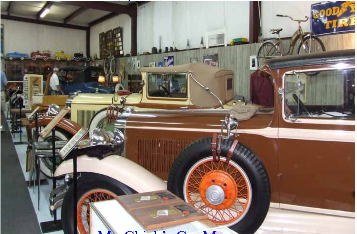
Mr. Chick's Car Museum