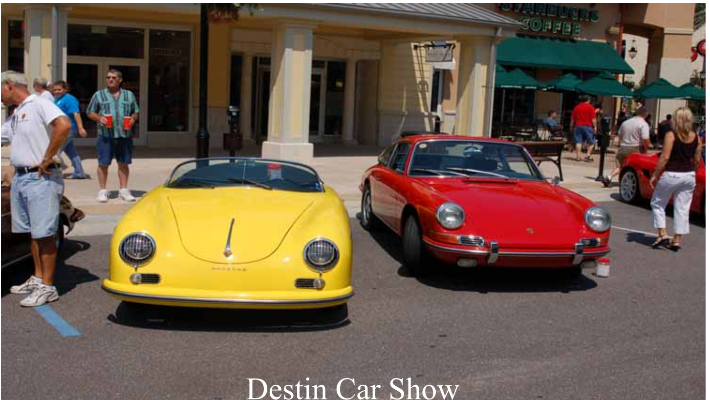
Destin Car Show