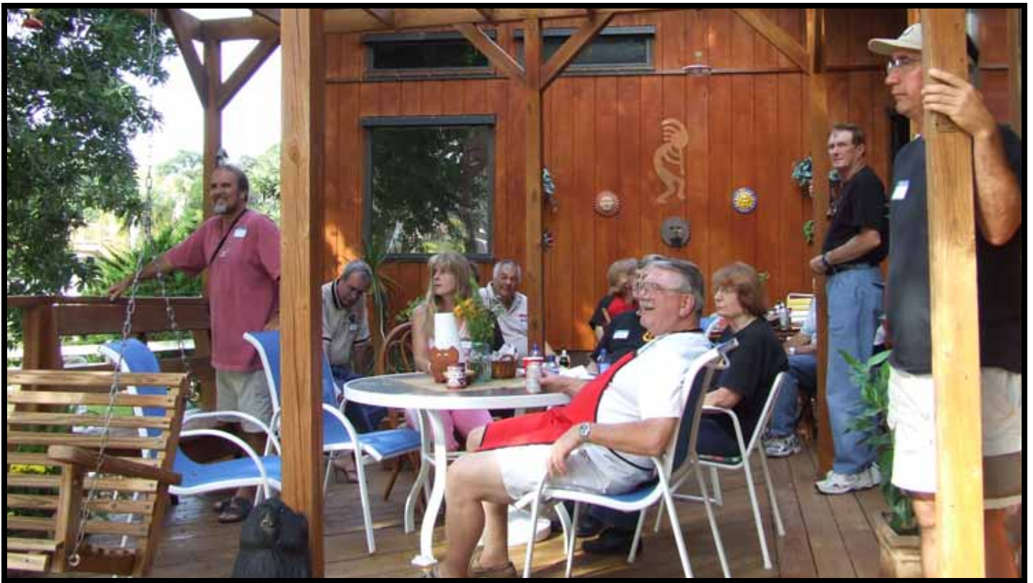
Squeals and Wheels