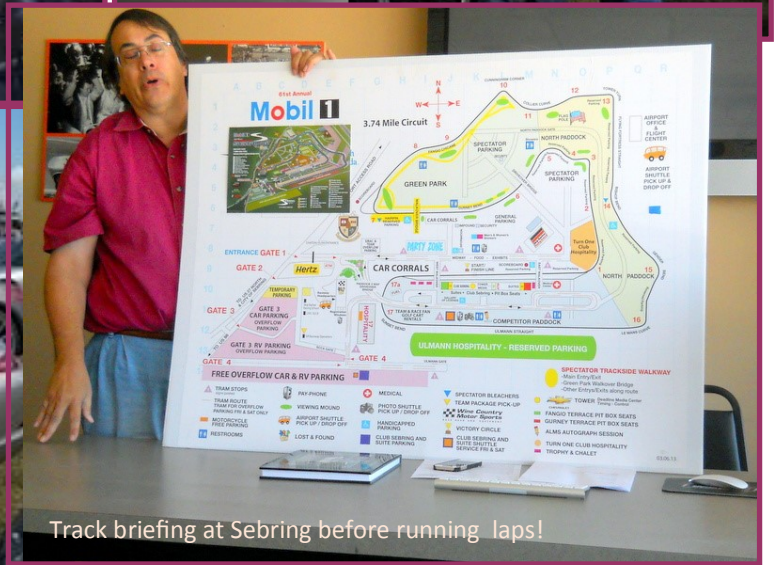
Track briefing at Sebring before running laps!