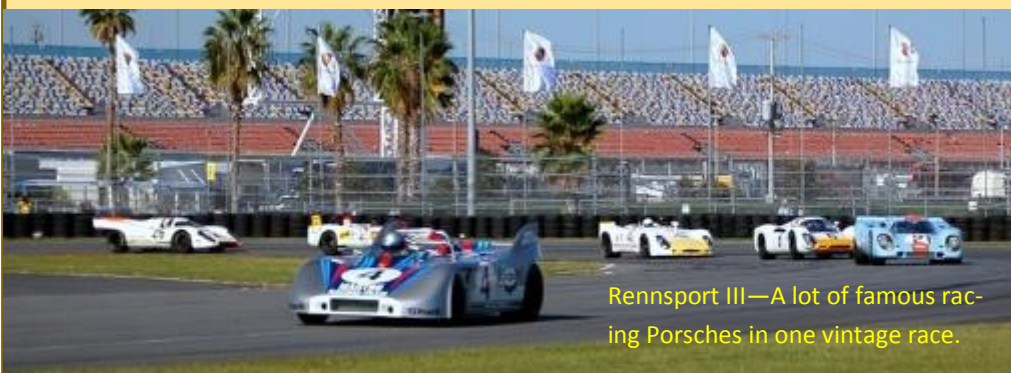
Rennsport III—A lot of famous racing Porsches in one vintage race.

( www.mazdaraceway.com ) as they become available. Ticket information is now available by contacting 1-800-327-7322. Flyer on the next page. 📄