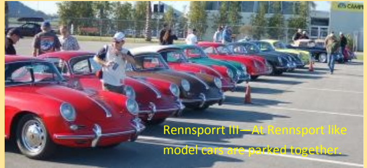
Rennsport III—At Rennsport like model cars are parked together.

On October 9, 2014, Porsche Cars North America (PCNA) and Mazda Raceway Laguna Seca announced that the next Porsche Rennsport Reunion, the fifth, will be held at the famed California racetrack during the weekend of October 9-11, 2015. This incomparable event is held about every three years with the first three held on the East Coast. The first was held at Lime Rock, Connecticut in 2001 followed by the second and third at Daytona International Speedway in 2004 and 2007 while the last, Rennsport Reunion IV, was held at Mazda Raceway Laguna Seca where approximately 1300 Porsche Club of America (PCA) member-owned Porsches from the past 66 years filled the show fields, racing classes and parking lots of Mazda Raceway Laguna Seca. For next year's rendition, PCA will be celebrating its 60th year in existence which should provide a notable background for the activities. Though the detailed program has not yet been announced, it is anticipated that Porsche