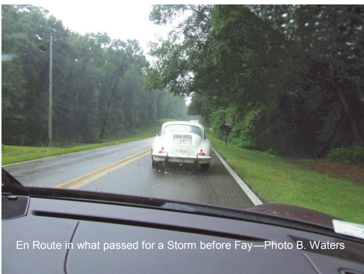
En Route in what passed for a Storm before Fay