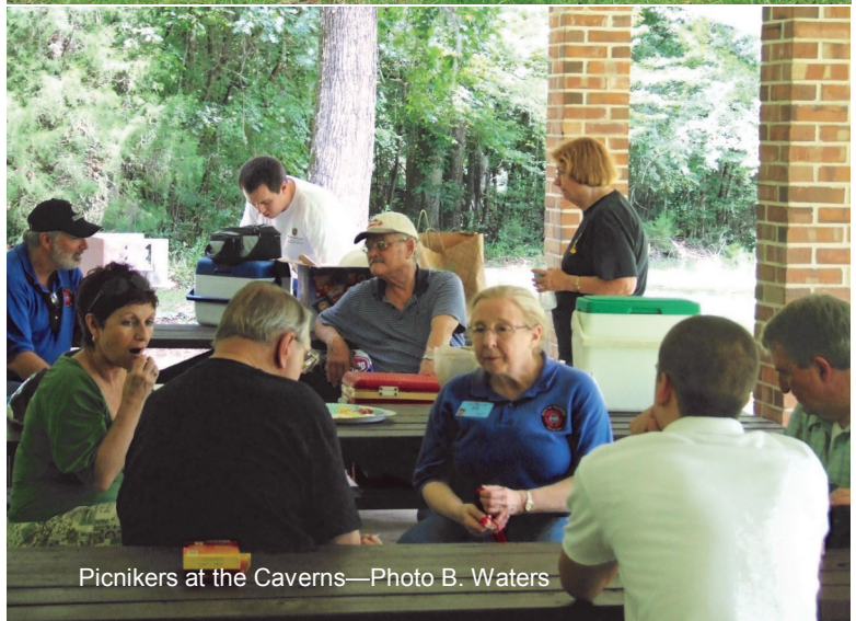
Picnikers at the Caverns