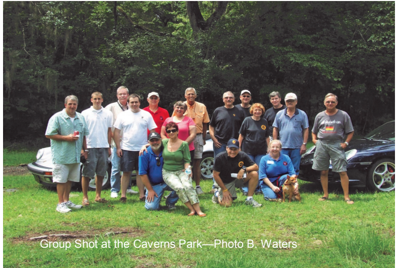
Group Shot at the Caverns Park